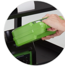
Simply swap with a fully charged pack in seconds