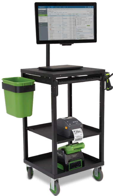
EC Series with PowerSwap Nucleus™ MINI power system (includes stand-alone charging station)