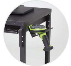
Easily integrate a wide variety of accessories