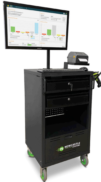
Enclose the EC Series cart with optional set of metal side panels (B434) and metal rear panel (B435) or metal pegboard panel (B433)